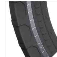
Ambidextrous Windowed Main Body