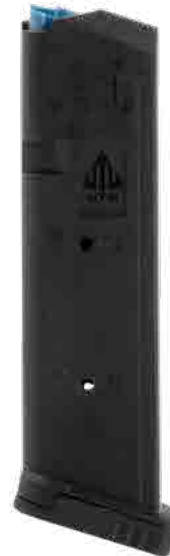
9 MM | 17 ROUND ■ / RBT-GL917