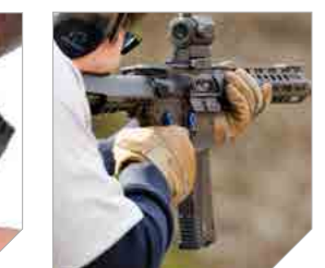
Fully Automatic Torture Tested