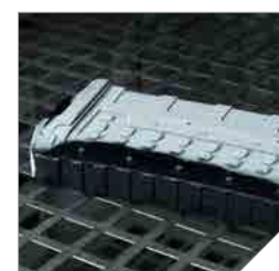
Adverse -40°F to 160°F Temperature Tested