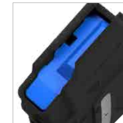
High Visibility Blue Follower and Stainless Steel Spring