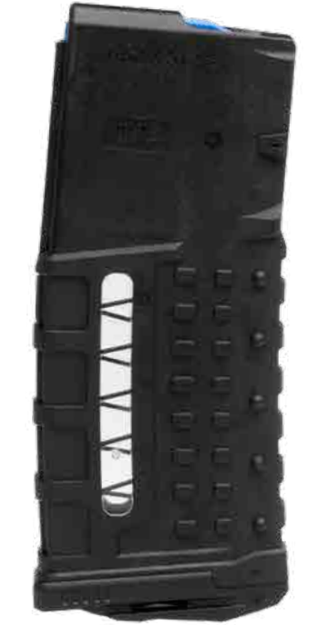
.308 | 25 ROUND | WINDOWED ■ / RBT-DM25