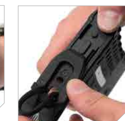
Removable Flared Floor Plate