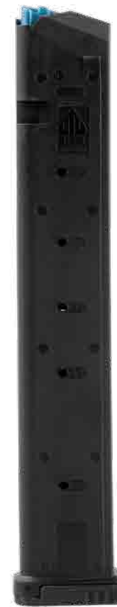
9 MM | 33 ROUND ■ / RBT-GL933