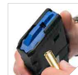
Four-way Anti-tilt High Visibility Blue Follower and High Longevity Stainless Steel Spring for Reliable Feeding