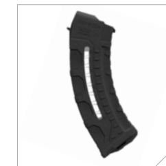
Impact & Heat Resistant Reinforced Polymer