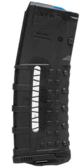
5.56 | 30 ROUND | WINDOWED ■ / RBT-AM30