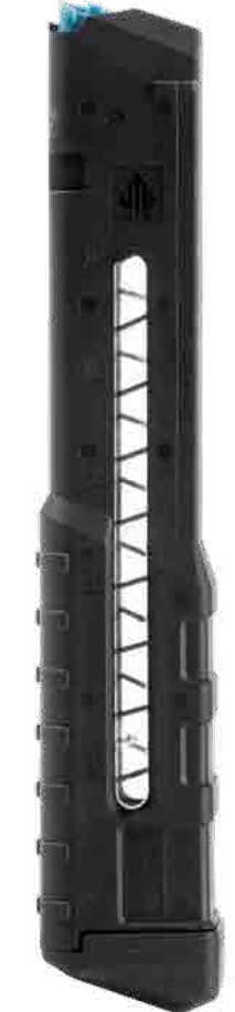
9 MM | 33 ROUND | WINDOWED ■ / RBT-PD933 PAT. PENDING