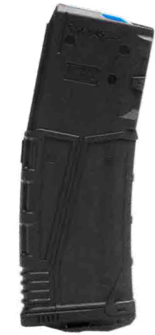
UTG PRO® 5.56 | 30 ROUND ■ / RBUAM01