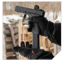
Live Fire Torture Tested