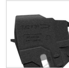
Steel-reinforced Feed Lips and Locking Lugs