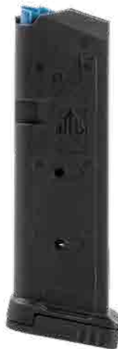
9 MM | 15 ROUND ■ / RBT-GL915