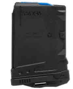
5.56 | 10 ROUND ■ / RBT-AM10