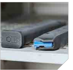
Adverse Temperature Tested