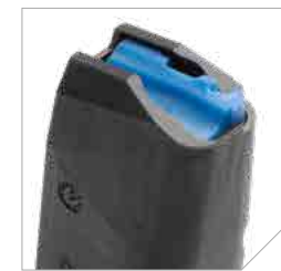
High Contrast Blue Anti-tilt Follower