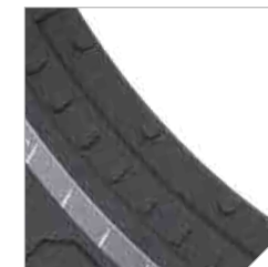
Raised Bosses for Added Grip Retention